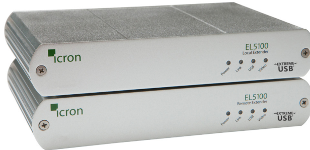
LEX (Local Extender)

The EL5100 extends both DVI and USB 2.0 up to 100m using a single Cat 5e* cable.