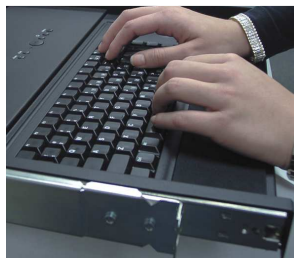
Easy access right at the rack

PC's, and SUN computers can easily be accessed, monitored, and controlled locally using RackView Widescreen.