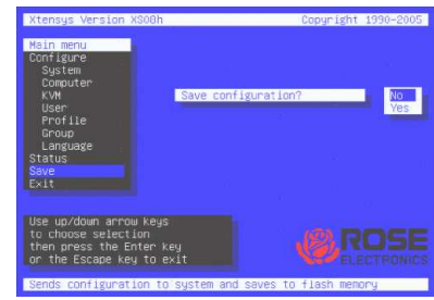
Easy to use OSD for configuration

■ Phone: 281-933-7673 ■ E-mail: sales@rose.com ■