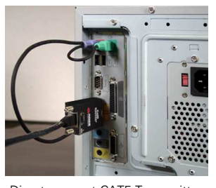
Direct connect CAT5 Transmitter streamlines your installation

Europe and Asia, Rose provides a full range of capabilities and support. Call us today for more information about this and other Rose products.