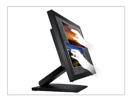
Integration of 10-point touch and projected capacitive touch technology provides accurate and precise touch experience