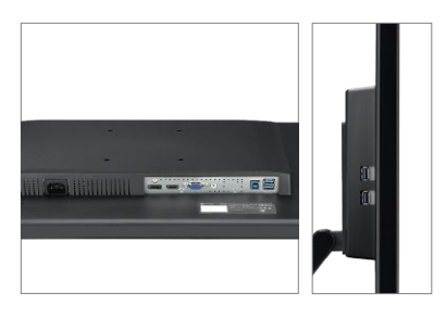
Versatile connectivity: VGA, HDMI, DisplayPort and USB port allow for effortless system integration