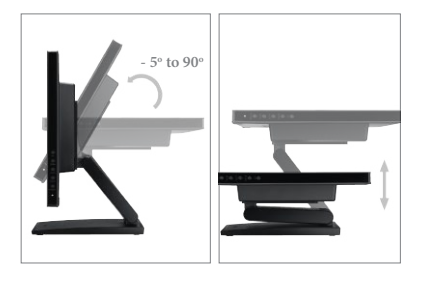
Flexible dual-hinge stand design to maximise viewing comfort for multiple users